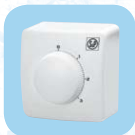
Three-speed control included. Dimensions LxWxH (mm): 80x80x70